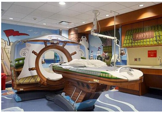
Fig.1 Pirate-Themed Ct Scanner

as well as the work efficiency of doctors be improved significantly.[2] The CT machine in a children's hospital in the United States, as shown in Figure 1, was designed by an emotionalized design method to improve and optimize the appearance of traditional CT examination. It improves the acceptance of medical equipment in the heart of pediatric patients and reduces their fear and tension in the examining process.