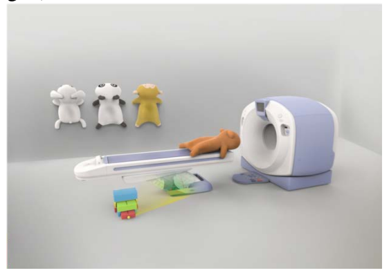
Fig.4 Overall Design Sketch

Based on these designs, children can have a sense of participation. These designs can reduce the inner resistance of children, so as to better match and complete the examination with doctors. (design sketch is shown in Fig. 4)